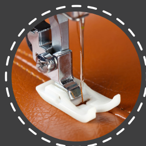
5 mm LEATHER