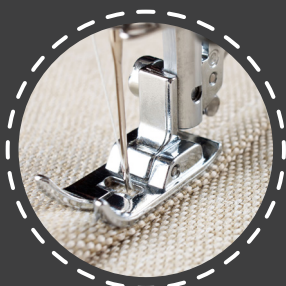
6 mm CANVAS