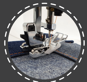
6 mm JEANS